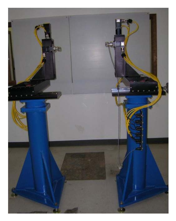
Figure 2: Flip Coil Towers

Typically, 25 turns are used. The number of turns must be entered on the IGOR display for an accurate measurement. Beryllium copper wire, 40-41 AWG, is used for the flip coil's winding. The tensioning screw is provided on the master tower that is used to re-tension the coil as it will stretch.