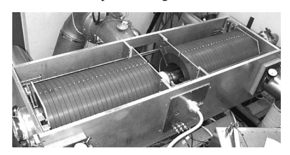
Figure 1: Ferrite loaded cavity C02

A classic and conservative NiZn ferrite-based design was chosen, replicating essentially the one-gap design with virtual ground symmetry in the gap mid plane of the other two PSB RF system cavities (Fig 1)[5]. Air cooling of the ferrite through 1 mm spacing between rings gives the best ferrite filling factor, keeps the mechanical construction simple and is very cost effective compared with water cooling. The choice of Philips ferrite material grade 4A11 was made after tests on several small size ring samples, with the absence of resonant absorption phenomena in the required working area as main criterion. Booster operation implies synchronisation of the four rings with the PS cycle on a magnetic flat top at sometimes constant or very slowly changing RF frequency. It is known, that under such conditions ferrite can jump into the so-called High Loss Mode (HLM) at critical excitation and disturb the servo control of the RF voltage amplitude [3]. The onset of HLM appears to arrive earlier at higher DC saturation of the ferrite, i.e. at a higher frequency in our tuned cavities. The ferrite volume and cross section was chosen to stay safely below HLM onset at nominal RF voltage. The selected ferrite grade exhibits a smooth and fairly stable transition into HLM and experience has shown that safe operation well beyond nominal voltage is possible. A temperature check of the individual rings in the operational cavities replaced laborious ferrite reception testing.