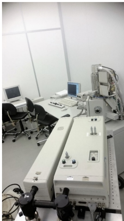
Figure 1: Installation of lasers in front of SEM at the Ångström Laboratory clean room.

Content from this work may be used under the terms of the CC BY 3.0 licence (© 2018). Any distribution of this work must maintain attribution to the author(s), title of the work, publisher, and DOI.