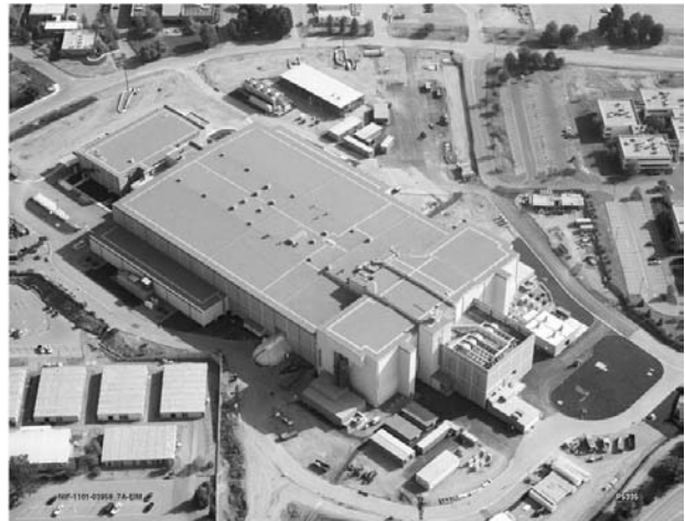
Figure 1: The National Ignition Facility (NIF).

When completed in 2008, NIF will provide up to 192 energetic laser beams to compress deuterium-tritium fusion targets to conditions where they will ignite and burn, liberating more energy than is required to initiate the fusion reactions. NIF experiments will allow the study of physical processes at temperatures approaching 100 million K and 100 billion times atmospheric pressure. These conditions exist naturally only in the interior of stars and in nuclear weapons explosions [1,2].