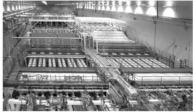
Figure 2: Laser Bay 2 contains the PAM and amplifiers.

From the PAM the laser beam next enters the main laser system located in the laser bay (Figure 2), which consists of two large amplifier units that amplify the output pulse from the PAM to the required energy and power. The amplifiers use 3,072 40-kilogram slabs of neodymium-doped phosphate glass. The slabs are stacked four high and two wide to accommodate a "bundle" of eight laser beams. The amplifiers provide 99.9% of NIF's power and energy.