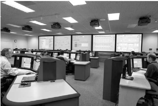
Figure 3: The NIF Control Room supports 14 operators.

The Integrated Computer Control System (ICCS) is being developed to operate the NIF facility from a central control room with 14 operator positions (Figure 3). The operator consoles provide the human interface in the form of operator displays, data retrieval and processing, and coordination of control functions. Supervisory software is partitioned into several cohesive subsystems, each of which controls a primary NIF subsystem such as beam alignment or power conditioning. Several databases and file servers are incorporated to manage both experimental data and data used during operations and maintenance.