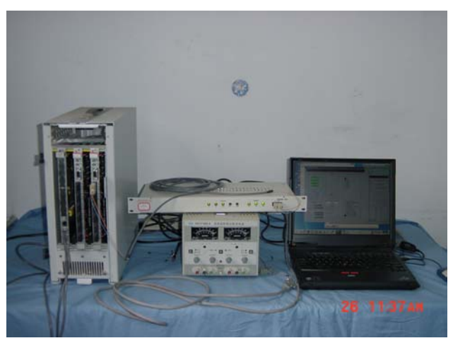
Figure 2: Portable PSC/PSI Configuration

The VME based PSC/PSI system has been built up. Figure 2 is portable configuration for VME based test. It is comprised of a small VME crate with a CPU board and PSC connected to a remote PSI.