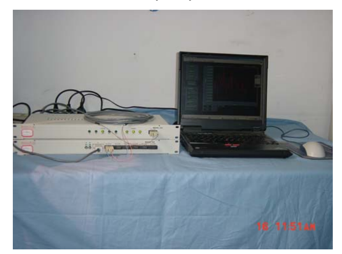
Figure 3: Standalone PSC Configuration.

This system has also been tested with the prototype power supply including current setting and readback in normal mode. For fast reads, burst mode is used and data is stored in memory. Data in memory can be read out and created a curve for stability analysis.