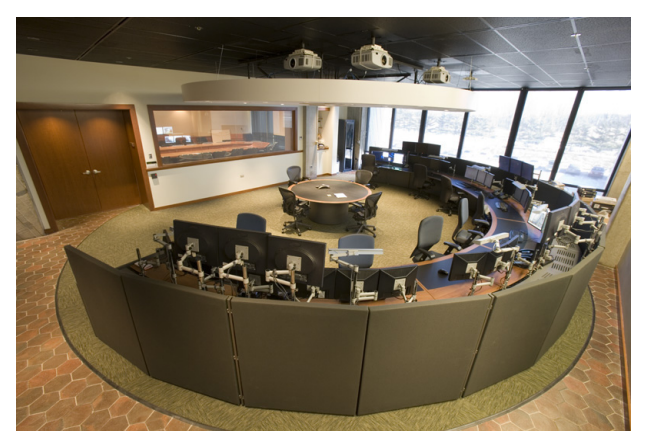
Figure 1: Completed LHC@FNAL Remote Operations Center.

Commissioning the LHC accelerator and experiments will be a vital part of the worldwide high-energy physics program beginning in 2008. A remote operations center, LHC@FNAL, has been built at Fermilab to make it easier for accelerator scientists and experimentalists working in North America to help commission and participate in operations of the LHC and experiments. Evolution of this center from concept through construction and early use will be presented as will details of its controls system, management, and expected future use.