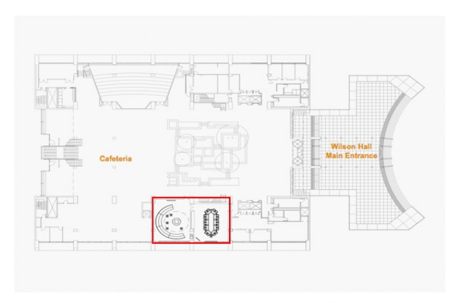
Figure 2: Layout and Orientation of LHC@FNAL on the main floor of Wilson Hall at Fermilab.

An important part of the process was visits to various control rooms around the world. Although the basis for design was the new CERN Control Centre (CCC) the task force wished to learn concepts behind the design of other modern facilities and user response to same.