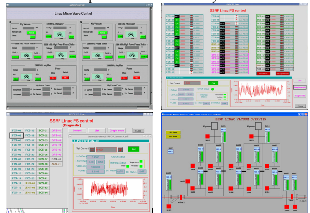
Figure 4: OPI panel of Linac control system.

the ILINUXFedora 7. The EDM file store on NFS file server and all the client can access it by a start stript. Fig. 4 show some OPI panel of SSRF control system.