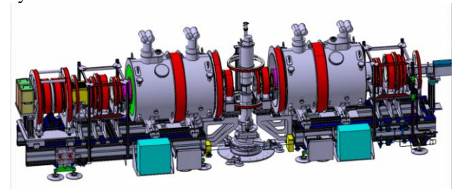
Figure 1: NSE secondary spectrometer; detector is on the left side.

Conceptionally, the NSE instrument can be subdivided into the primary and the secondary spectrometer. The primary spectrometer includes the neutron guide system with removable segments allowing the adjustment of the moderator-detector distance between 18m and 27m. A cascade of 4 choppers separates neutron frames, which come from the pulsed source. For different neutron wave lengths polarizing benders in the neutron guide can be exchanged by a revolver system. The whole neutron guide system is evacuated.