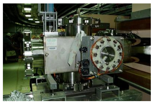
Figure 2: Primary stripper foil mechanism.

The controls for the insertable foils and scrapers were developed by Brookhaven National Laboratory. The scraper devices are designed to be precisely positioned into the edge of the beam to remove electrons from the particles that are outside the desired beam profile. These scraped particles are then routed to a collimator or dump. A single axis of motion is provided. A feedback potentiometer is used to accurately determine the position of the edge of the foil in relation to the centroid of the desired beam line. Due to the mechanical design of the 4ring primary scraper, a brake was required to hold the mechanism in the desired position.