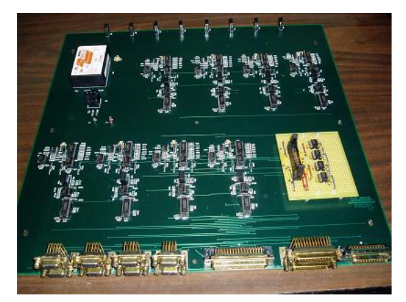
Figure 5: VME interface module (large green board) and PLC interface module (small yellow board).

The AMCI module step and direction signals are TTL compatible and thus interface directly with the Phytron stepper motor drives. The switch inputs for the clockwise, counterclockwise, and home limit switches are designed for 24 vdc signals and were connected directly to the wiring from the switches. This greatly reduces the size and complexity of the interface modules.