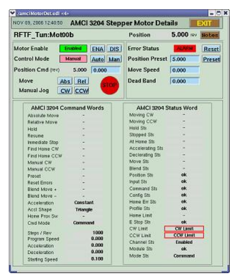
Figure 7: EPICS stepper motor detail screen.

While a mature EPICS device driver is available for the Pro-Dex VME-58 module, a PLC-based device driver had to be developed for the AMIC module. The minimal PLC programming examples provided with the module were barely enough to make the module operate and much less than the detail required to start the development of an interface.