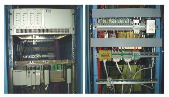
Figure 6a and 6b: Front and rear of PLC-based stepper motor control cabinet.