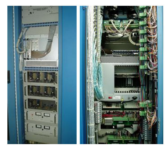
Figure 4a and 4b: Front and rear of VME-based stepper motor control cabinet.

The stepper motor control board chosen was the Pro-Dex VME58 8-channel stepper motor controller. Pacific Scientific stepper motor drive modules were used to power the motors. A custom module designed by Brookhaven is used to interface six of the eight channels of the Pro-Dex module to the drives and limit switches. Thus, two of the Pro-Dex channels are not used. The auxiliary outputs provided on the Pro-Dex module were used to control the brake. A VMIC module is used to monitor the primary stripper foil position switches. External relays are used to convert the 24 vdc signal from the limit and position switches to TTL levels.