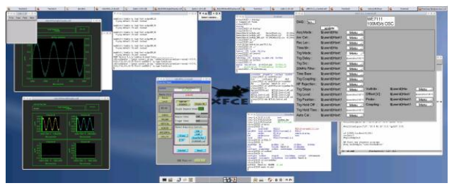
Figure 2: Software Development with a 2-display TC

Successful Result with Software Development