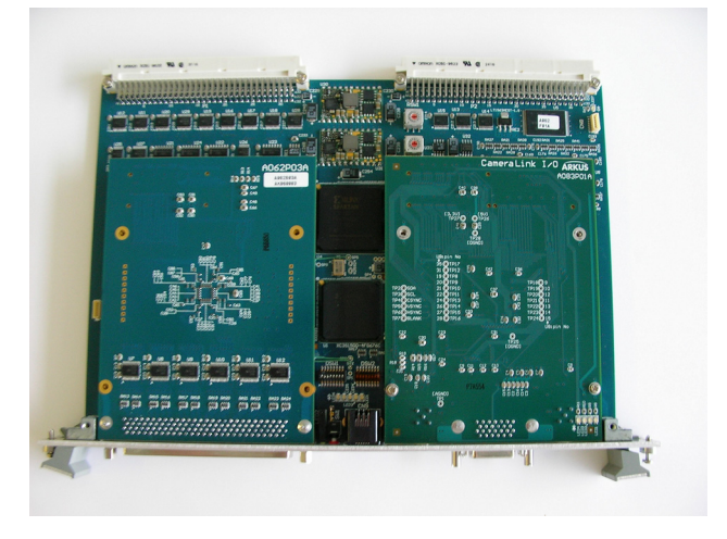
Figure 1: A photograph of the flexible and logic-reconfigurable VME board mounted with DIO (left side) and camera link grabber (right side) daughter boards. The user FPGA (lower) and bus-control FPGA (upper) are mounted in the middle of the base board.

for their own system and develop the logic of the sequences to be carried out. If the specifications of the existing I/O daughter board do not fit the user's system, the user only needs to develop a simple I/O module. The same base board can be used with different I/Os with a small modification of the logic and without any modification of the hardware, such as a printed circuit board design. This design concept provides high flexibility for I/Os and shortens the hardware development time.