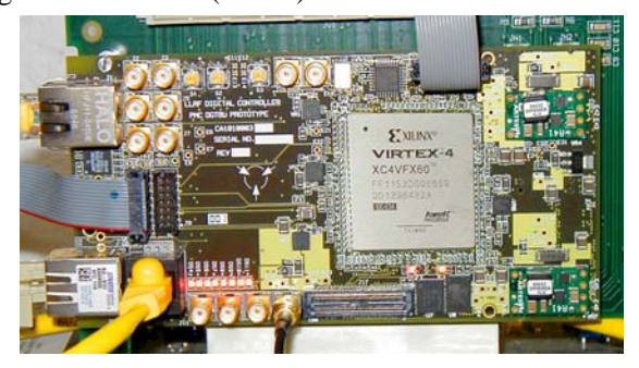
Figure 1: Custom design PMC module using ML310's 3.3V PCI slot to obtain power.

The major hardware elements on the board (Figure 1) are the FPGA device, a 100Mb/s Ethernet port, a RS-232 serial port, a DDR2 memory module, discrete SDR SDRAM, one on-board flash device, one 32-bit/33 MHz PMC connector set and a complete set of SMA and fiber optic connectors to support the FPGA-based serial multigigabit transceivers (MGTs).