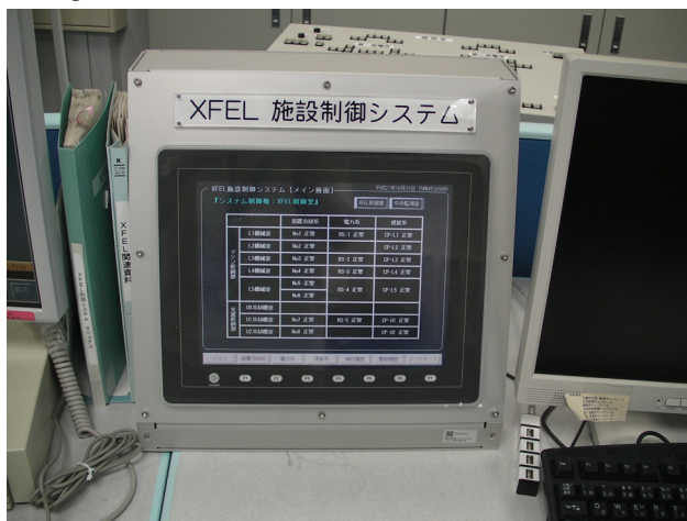
Figure 2: Graphic panel of the XFEL facility control system deployed at the SPring-8 facility monitoring center.

In May 2009, daily management was started by using the graphic panel (Fig. 2) deployed at the SPring-8 facility monitoring center along with the SPring-8 facility management.