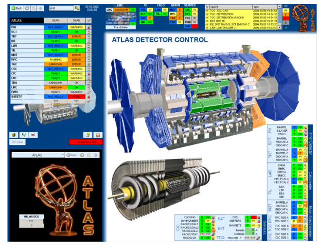
Figure 2: ATLAS FSM operator interface.

Further interfaces used on demand are tools for data visualization, process log viewer, and operator log book. Full remote access to all user interfaces is possible by a terminal server for expert operators only. Static status monitoring is provided by web pages on a dedicated web server world-wide [8]. An example of an operator interface of the ATLAS FSM is shown in Figure 2, representing the global state of ATLAS and each sub-detector.