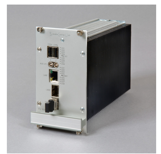
Figure 2: Mechanical model of the SCU.

SCUs will be generally integrated in the equipment (e.g. power converter cabinet) to be controlled. Form factor and equipment interface connector have been defined in a way to provide maximum compatibility with present equipment systems at GSI for seamless integration and easy upgrade. A mechanical model of the SCU is shown in Figure 2.