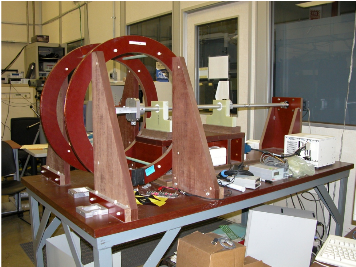
Figure 1: Helmholtz coil magnet measurement system.

mounted inline on the stage shaft. The encoder has 360 degrees freedom with 0.05-degree resolution. The rotary encoder is used to accurately define the angular position of the magnet mounted on the rotary stage.