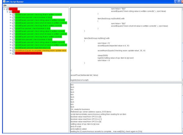
Figure 2: OPC Test Script Runner GUI layout.

A dynamic language such as Groovy was an important choice for the upper portion of the test script runner in order to aid defining the Domain Specific Language [2] (DSL) in which the test scripts are written. DSLs are 'small languages', designed for a particular field and consisting of nouns and verbs specific to that field. The field in this case is OPC testing, OPC nouns from the DSL include familiar OPC terms such as 'group' and 'item' and verbs pertaining to OPC nouns like an item's 'asyncWrite' or a group's 'destroy' plus unit test style verbs such as 'assertTrue' or 'assertNotEqual'. The DSL for the test scripts has been designed to promote readability, the idea is that 3rd party users such as an OPC Server vendor should be able to read a testscript and understand it in terms of the OPC interactions.