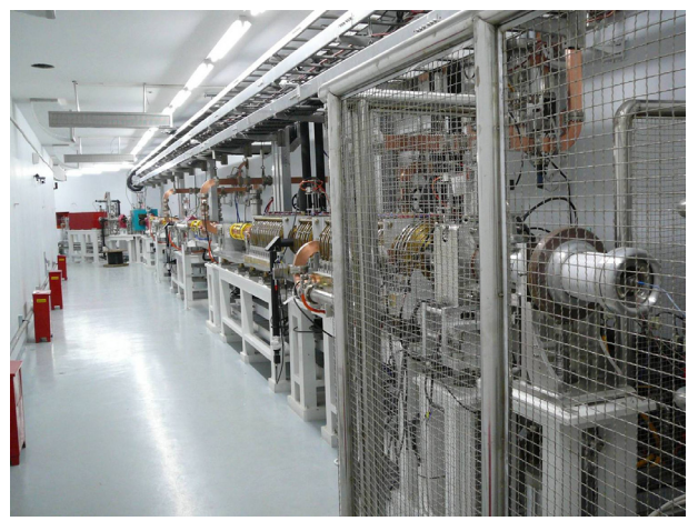
Figure 1: 150MeV Linac of SSRF.

The Linac RF control system has been put into operation since July of 2007 and worked stably by now.