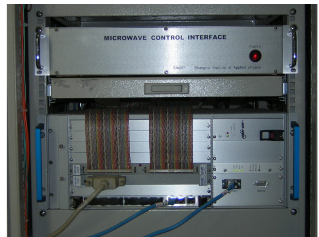
Figure 4: IOC controller and Interface.

The RF Controller and interface are shown in Figure 4. It consist of a 9-slot VME crate, a MVME 5500 CPU board, a VMIVME 2536 digital I/O isolated interface board and a VMIVME3125 A/D isolated interface board.