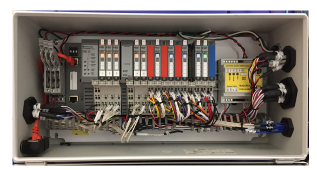
Figure 3: EPS remote I/O box module layout.

ICALEPCS2017, Barcelona, Spain JACoW Publishing doi:10.18429/JACoW-ICALEPCS2017-TUPHA095