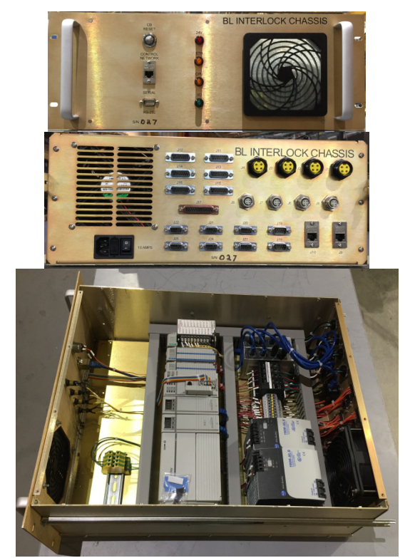
Figure 1: Intelligent Chassis Front/Rear Panel and Module Layout.

Each beamline has only one PLC, e.g. one controller, which resides in the intelligent chassis. This chassis is a 4U high, 19 inch crate. It contains one controller, power supply modules, network modules, I/O modules and other modules. Figure 1 shows the front/rear panel, and chassis module lavout.