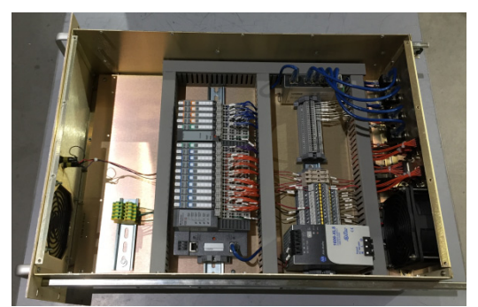
Figure 2: Vacuum interlock chassis module layout.

For beamlines with many vacuum components, additional vacuum interlock chassis are installed in vacuum controller racks, where needed. The vacuum chassis is the same size as the intelligent chassis. It has front and rear panels that are similar to the intelligent chassis. The chassis module layout can be seen in Figure 2.