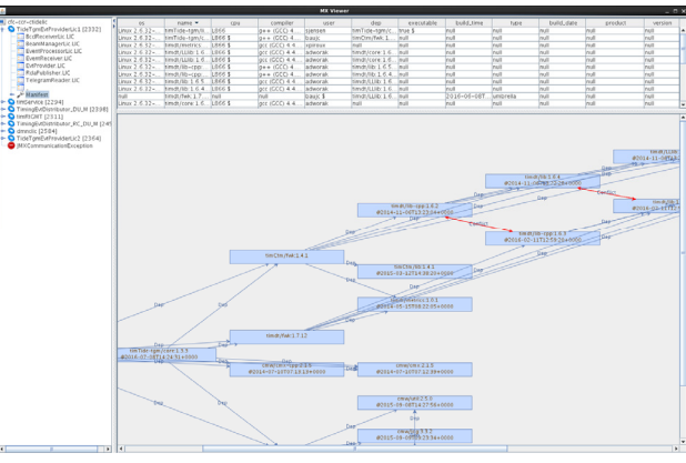
Figure 1: Dependency graph showing conflicts in red.

Future: The mechanism should alert users on dependency conflicts, rather than silently capturing them – possibly by breaking the build process.