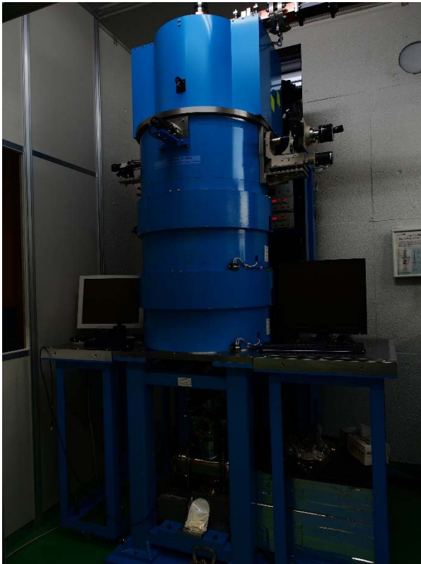
Figure 1: The first prototype of UEM using RF gun, which was constructed at Osaka University in 2012 and upgraded in 2014 and 2015.

TEM imaging system is able to make a TEM image with the magnification of 10,000 times for the 2 MeV electron beam.