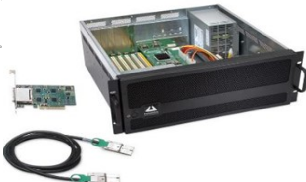
Figure 3: PCI-Express – PCI converter.

As mentioned at the outset, information of the timing