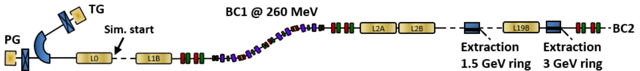
Figure 1: Compact layout of the MAX IV Linac. Yellow denotes radiofrequency (RF) structures, red/green are focusing/defocusing quadrupole magnets, purple are dipole magnets, orange are sextupole magnets and blue are special magnets. PG and TG are photo-cathode and thermionic RF guns, respectively, L are the linac sections and BC1 is the first bunch compressor. This view is cut right before BC2, which is shown in Fig. 2.