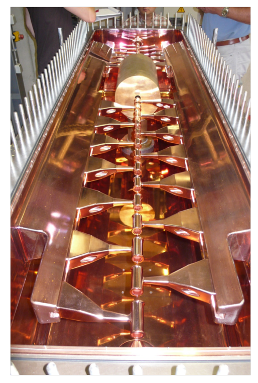
Figure 3: IH-cavity of the BNL EBIS Linac is very similar to the first IH-cavity of the heavy ion front-end [4].