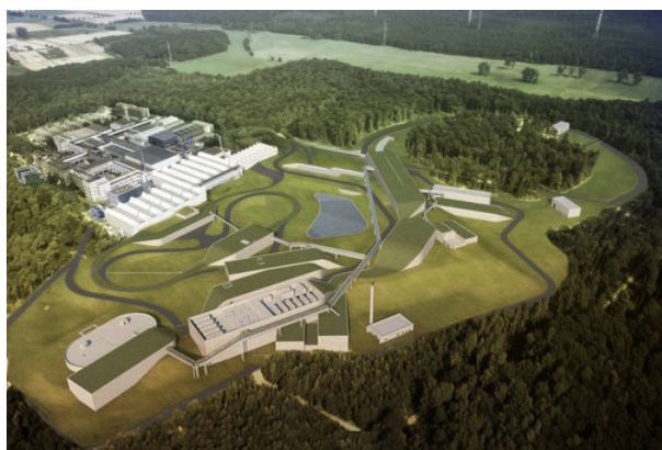
Figure 1: Illustration of the future FAIR facility [1].

The FAIR particle accelerator facility in Darmstadt, Germany is one of the world's biggest construction projects for international cutting-edge research. On a site of approximately 150,000 m 2 , 25 buildings are presently being constructed. Amongst them are the underground accelerator tunnel with 1100 m circumference, for the so-called SIS100 and other unique buildings, such as the extremely complex beam transfer building. They are designed in order to house and operate the newly developed high-tech research facilities.