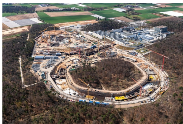
Figure 2: FAIR construction site, April 2021. View orientation: North to South [2].

building site of FAIR including the facility for the superconducting SIS100 ring accelerator. It is being built by means of the cut-and-cover construction method. In this process, the construction pit “moves” - in other words, the construction takes place in sections that are about 200 meters long [1]. Just like a dog chasing its own tail excavation began with a head start at the first section, immediately followed by foundation preparation and steelwork for the building. As a result, the excavation for the complete tunnel ring hasn't even ended when the first section of the building structure was finished and filled back with soil already.