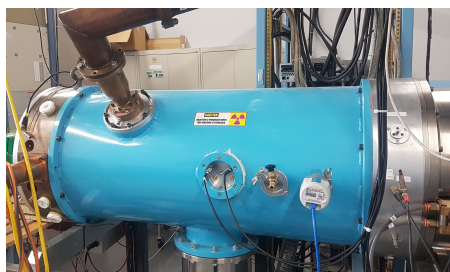
Figure 1: Side view of the ILS RFQ with power coupler, vacuum and diagnostic ports.

suitable for ions at low energy, where the velocity of the beam is low enough that the beam can be focused using transverse electric fields. At the core of the RFQ design are four electrodes, or veins, that help focus the electromagnetic fields to provide focusing to the beam. Tapering the veins introduce a longitudinal component of the electric field that provides acceleration to the beam. An RFQ is a very versatile device as it provides different functions within the same structure: beam capture, focusing, bunching and acceleration [6]. The RFQ becomes less efficient as the beam energy increases and it is usually the first accelerating stage in a system of different accelerating structures, usually deliver the beam into a Drift Tube Linac (DTL). The ILS linac uses an RFI, an optimized version of the RFQ that allows to reach the proton beam energy required for BNCT in a shorter distance than using a DTL. The RFI alone has been found to be four times more efficient than equivalent RFQ or DTL linacs [2]. The length of the full ILS proton linac is quite compact at about 2.8 m.