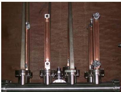
Figure 3: SiC loads and water-cooled RF loads under vacuum processing

RF output load has a function of absorption of residual travelling wave around the exit of accelerating column without reflection. The direct water-cooled RF output loads produced by IHEP were initially installed in the accelerating columns. At commissioning stages, some RF loads appeared water leaks in welded joint due to the fabrication errors. Recently, new indirect RF output load using SiC ceramic developed by H. Matsumoto[6] was adopted to prevent the water leaks. SiC loads was successfully operated with up to 50-MW of RF power at a 1 \mu s pulse width and 50 Hz repetition rate in the 2856 MHz. The input VSWR obtained was less than 1:1.1 at the maximum RF power. In order to prevent the water leaks by micro-cracks on the welding point of the water-cooled output loads, the newly designed SiC loads were prepared and replaced. Six modules including preinjector in PLS linac have been replaced with SiC output loads. The fabricated SiC loads and water loads under vacuum processing are shown Fig. 3.