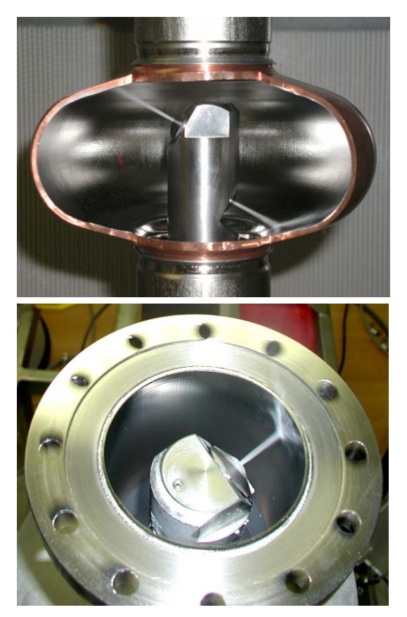
Figure 3: Nozzle test in a cut NbCu cavity (top) and in the beam tube of a Nb monocell (bottom).