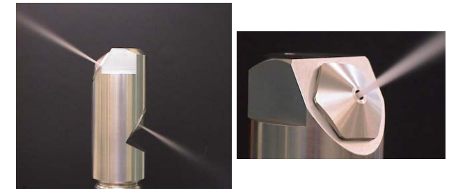
Figure 2: Nozzle system for cavity cleaning.

An overview of the prototype set-up for cleaning of monocell cavities is given in figure 1. A major component is the chiller/purifier system for purifying and particle filtering of the technical-grade CO_2 . The temperature of