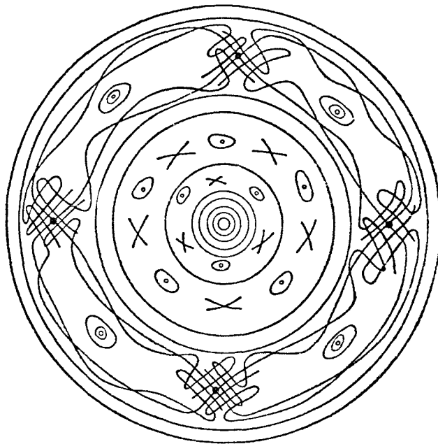
Figure 3 Phase plane for one dimensional motion (with a time-dependent periodic Hamiltonian).