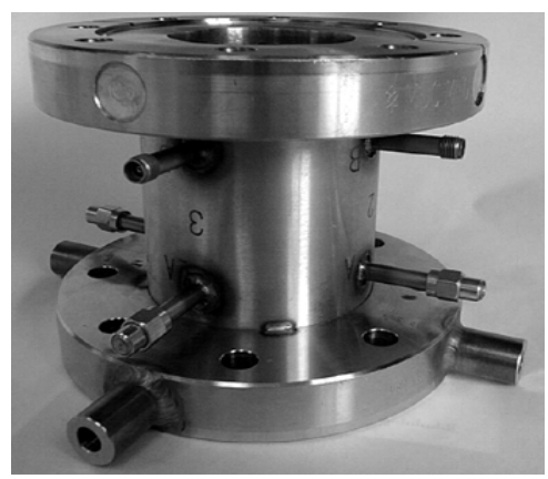
Figure 1: This LEDA 5-cm-aperture micro-stripline BPM has a 45 degree subtended angle and a 5-cm-length electrode.

The BPMs are a four-electrode micro-stripline design with electrode characteristic impedances of 50-\Omega . Each BPM has a physical feature that provides alignment verification with respect to the facility alignment references and ultimately with respect to the linac magnetic lattice. These alignment features also serve as a method to mate the BPM to its mapping fixture so that it's mapped electrical characteristics are directly related to the measured beam position. For the pictured LEDA HEBT BPM shown in Fig. 1, four optical-alignmentmonument mounts are welded on the downstream vacuum Those APT BPMs that are mounted within quadrupole magnets have additional constraints. For these BPMs, construction processes and materials are used to minimize the BPM's permeability and to ensure that the quadrupole magnetic fields are undistorted.