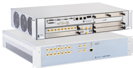
Figure 2: The LIGHT LLRF system implemented in the Libera LLRF platform.

For the LIGHT LLRF application, the Libera LLRF system will be controlling the amplitude and phase of a probe signal through pulse-by-pulse feedback. Two separ-