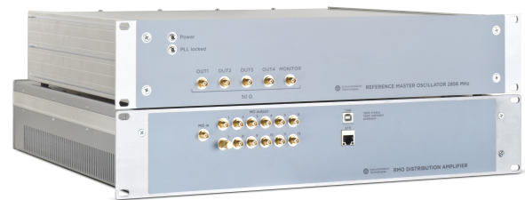
Figure 3: Instrumentation Technologies RMO and distribution amplifier temperature stabilized units.

An RMO (Reference Master Oscillator) temperature stabilized RF source and distribution amplifier units are used to provide stable, low jitter MO signals to all 12 LLRF units at 2997.92 MHz and a sub-harmonic RFQ MO frequency at 749.38 MHz (Figure 3).