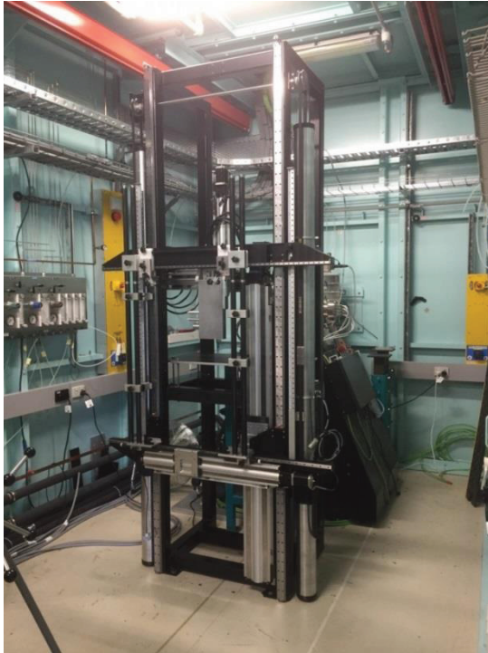
Figure 6: Milliprobe scanner station recently installed in XFM end station.

and moving both platforms in the upper & lower positions along the wide rails & bearings. Ultimately confirming parallelism of the linear tracks, with the rigidity of the carbon fiber tubing assembly being paramount.