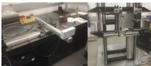
Figure 3: X stage assessment. Figure 4: Small artwork installation.

The tube mandrel is wound with unidirectional carbon fiber around the diameter, and then wrapped with fibers along the length (longitudinally). It is completed with a wrap of 3k twill before it is cured in an autoclave, roll sanded then recoated with epoxy. The assessment below was paramount to our design, clarifying twisting of the horizontal stage in its maximum stroke, securing the complete surface area to the breadboard table.