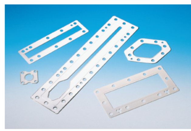
Figure 1: VATSEAL gaskets from VAT, CH [4].

For wide open or non-symmetrically flange apertures flange connections with VATSEAL [4] gaskets are used, instead of normal Conflat (CF) with copper gasket rings. VATSEAL connections are made for special vacuum connections, RF structures and as well as for synchrotron beamlines. Further requirements for all-metal seal connections with VATSEAT gaskets are low permeation, low outgassing, baked-able, no hydrocarbons, low particle emission and radiation resistive. Figure 1 shows a few VATSEAL gaskets.