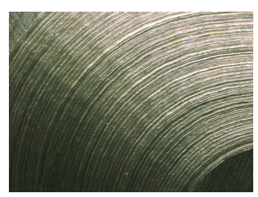
Figure 3: A macro image 10:1 of the "sealing grove". Core technology developments Vacuum

By using this technology, it is not necessary to finish the surface. The require VATSEAL parameters for roughness and flatness, shown in Table 1 are much more relaxed. The surface has to be milled conventionally with using normal machining tools for SST materials. A roughness in the range of Ra 0.6 µm is sufficient.