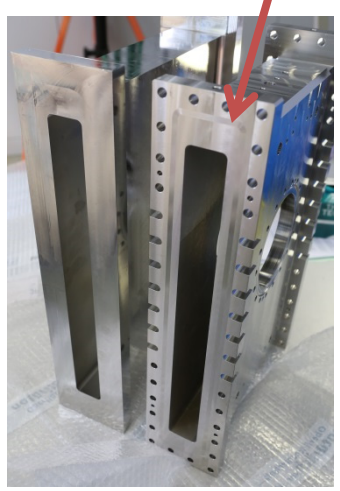
Figure 2: Left side BPMS as pre-part and on right a "ready part" of OTRS chamber with integrated "sealing grove", see arrow.

By using this technology, it is not necessary to finish the surface. The require VATSEAL parameters for roughness and flatness, shown in Table 1 are much more relaxed. The surface has to be milled conventionally with using normal machining tools for SST materials. A roughness in the range of Ra 0.6 µm is sufficient.