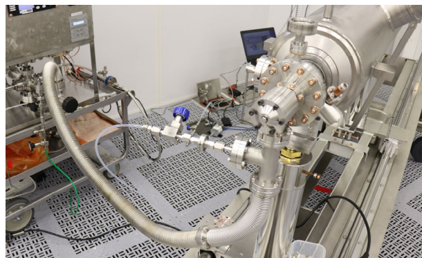
Figure 1: Filtered nitrogen supply and vacuum hose connected to cavity in the cleanroom.

Throughout the assembly process, there will be a flow of nitrogen available to keep the interior of the cavity clean. The supply is boil-off gas from a nitrogen dewar which is then passed through several filters before reaching the cavity. The final filter is placed as close as possible to the cavity to avoid the gathering of moving particulate from bellows flex hoses or valves into the cavity (Fig. 1).