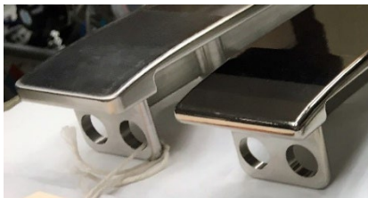
Figure 1: Wien filter electrode Rogowski profile.

frame, used to attach the electrodes to the vacuum chamber. This modification resulted in a maximum electric field of 3.9 MV/m (with +/- 25.6 kV per electrode), which combined with the corresponding magnetic field of 17.0 mT provides the conditions to rotate the spin angle by \pm\pi/2 rad of a 300 keV electron beam. The procedure to obtain these values is described in the following section.