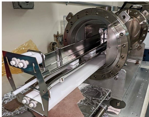
Figure 2: Picture taken during Wien filter assembly.

The single piece electrodes were polished with sand paper to remove tooling marks, with final polishing in a tumbler as described in [11]. After polishing, the electrodes were cleaned in an ultrasonic bath of diluted degreaser solution followed by rinsing in another ultrasonic bath of de-ionized water. Finally, the electrodes were vacuum degassed at 900 C for ~ 4 h. The device was assembled in a class 1000 clean room, following the same protocol and with the same components described in [5] used for the 130 keV Wien filter, with the exception of the reduced gap Inconel frame, used to hold the electrodes in place and shown at the left side of Fig. 2. Two different HV tests were performed: an initial standalone test where a 20 l/s ion pump was connected to one vacuum chamber end, while the other end was closed with a flange. The cross used to mount the ion pump was also connected to a turbo pump. In this case no windows were installed, and a 200 °C vacuum bake was performed during 48 hrs reaching a vacuum level of \sim 10^{-8} Torr after cool down. For the second test, the device was installed in a test bed accelerator at Jefferson Lab, followed by a 175 °C vacuum bake for 48 hrs, reaching a vacuum level of \sim 10^{-10} Torr after cool down. Two 20 l/s ion pumps were installed on crosses at the entrance and exit of the Wien filter location along the beam line.