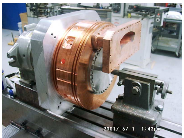
Figure 4: The single cell pillbox cavity is being fabricated at the Univ. of Mississippi. This photo shows the copper cavity body attached with the kidney shaped coupler.

The two halves of the cavity are machined to their final design shapes after the stainless steel rings are brazed. Figure 4 is a photo showing the cavity is being fabricated at the University of Mississippi. The kidney shaped coupler can also be seen in the photo. Three view ports that are equally spaced and added on the outside-wall of the cavity, which will be used for visually monitoring and inspecting the windows using a bore-scope during high RF power conditioning and tests. Three antenna probes are mounted on one side of the end-plate to measure the RF power and the frequency in the cavity.