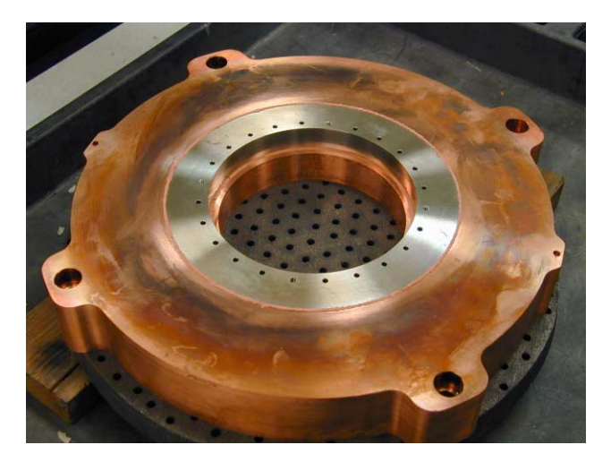
Figure 3: A stainless ring is brazed into the copper body of each half of the cavity. This photo shows the s.s. ring before it was put into hydrogen oven at Alpha-Braze a company in Fremont, California.

needs to be stiff enough to allow for multiple changes of the windows and enduring strong torque forces from the bolts. Two stainless steel rings are brazed into the two halves of the copper body separately, and allow for more and uniform torque forces to be exerted through the bolts. One of the stainless steel rings is shown in Figure 3.