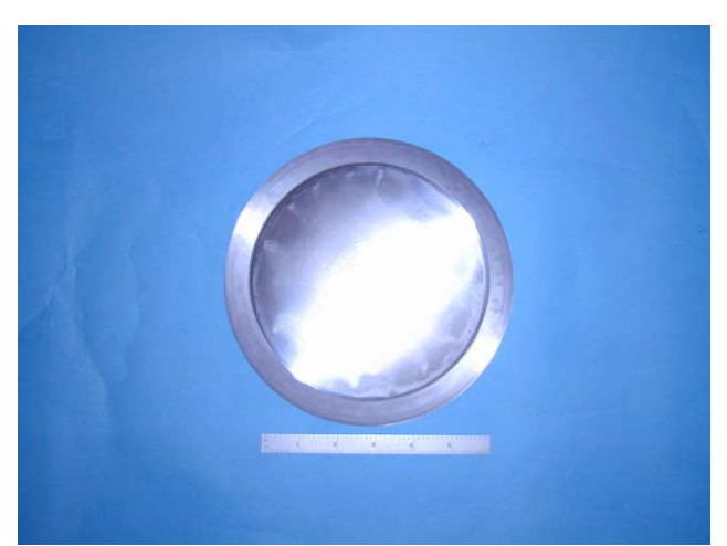
Figure 2: The Be window: a 127 \mu m thickness Be foil (IF-1) is sandwiched between two annular Be frames (PS-200) the fill line to the fill between the annular be frames (PS-

The cavity body is divided into two halves, and made from OFHC. The two halves will be brazed together in hydrogen oven after final tuning. The windows are made from high purity Be foils (IF-1, 99 % purity Be). Each foil is sandwiched in between two annular Be frames with less purity (PS-200, 98.5 %) by diffusion bonding (braze). Pre-tension is needed in keeping the foils flat, and is naturally induced from the brazing process. However, the exact amount of pre-tension is unknown, and difficult to measure and simulate. Measurements and modeling of the Be windows with pre-tension have been conducted in [2-4]. Figure 2 shows a 16 cm diameter, 127 µm thick Be window made by Brush-wellman, a company in Fremont, California.