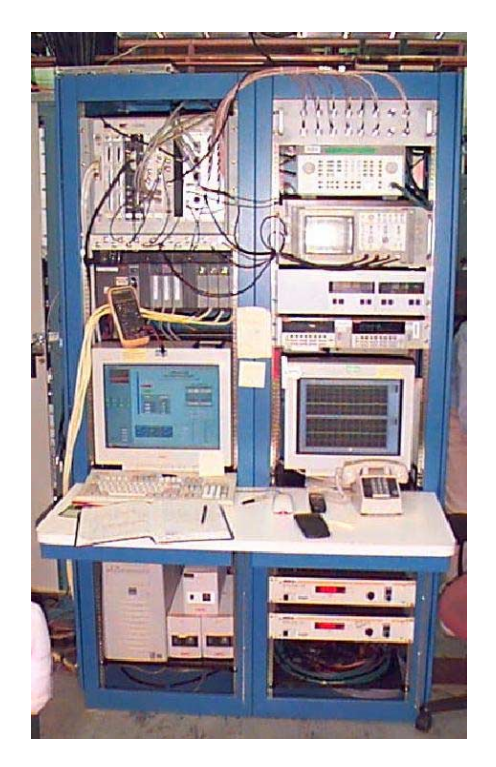
Figure 4: Instrumentation and data acquisition racks for SNS FPC RF processing

The instrumentation (shown in Figure 4) is distributed between a PLC, a VXI crate and a number of stand-alone instruments. Data acquisition and controls are accomplished by using a LabView-based program, which also is used to display and log the data acquired by the PLC. The interlocks are implemented in hardware with software monitoring and reset. The VXI instrumentation consists of RF power meters, a multi-channel ADC module, an arbitrary waveform generator, a custom logpower detector module, and a custom interlock and vacuum feedback module. Additionally, a PIN attenuator and PIN switch are mounted in the VXI crate in order to provide hardware interlock control of the RF drive signal.