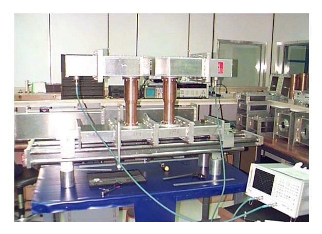
Figure 2: Experimental low-power RF setup for dimensioning the connecting waveguide

To allow for simultaneous RF conditioning and power testing of two SNS FPCs under UHV, each pair of FPCs is mounted in a connecting waveguide, operated in transmission mode from one coupler to the other. Since the actual couplers were not available during the design process, the dimensions of the unplated stainless steel connecting waveguide were based on estimated values obtained in numerical simulations [2] and low-power RF measurements using a tapered model of the FPCs and the actual doorknobs in an experimental setup, shown in Figure 2.