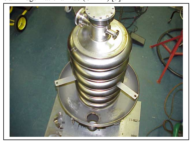
Figure 3. Cavity with Center Supports & Head

The support and alignment structure utilize the same double-X pattern of austenitic (Nitronic® 50) 0.5 cm diameter rods as proven reliable in the CEBAF cryomodule, which has the same diameter helium vessel. Based on modal analysis, the cavity has an additional center support internal to the helium vessel, which anchors the cavity in the transverse directions, yet allows movement along the beamline axis for cooldown and tuning (Figure 3). Each helium vessel is secured in the axial direction via 0.5 cm Nitronic® 50. All of the cavity/helium vessel supports have been designed to compensate for the additional loading due to transportation of the cryomodules from Jefferson Lab to Oak Ridge National Lab (ORNL) [3].