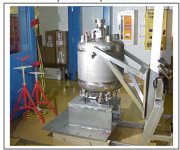
Figure 4. Cavity & Titanium Helium Vessel

Three additional 0.61 beta cavities are fabricated and shall be assembled with helium vessels following vertical testing. These next three cavity/helium vessel assemblies shall make up the cavity string for the medium beta prototype cryomodule. This prototype cavity string is scheduled to be completed and rolled out of the clean room for the next assembly stage in the fall of 2001. Once the testing has been completed on the prototype design, all information shall be evaluated and incorporated. Production shall begin in the spring of 2002 with thirty-three medium (0.61) beta cavities followed directly with the forty-eight high (0.81) beta cavities at the rate of one cryomodule per month. Cryomodules shall be cooled down and tested under power prior to shipment to ORNL for compliance with specifications.