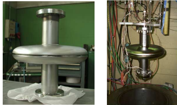
Figure 1. Prototype Z102 after welding in Zanon and Z101 during tests at Saclay

Of these cavities, the first one has already been tested in a vertical cryostat and its performances are discussed in the following paragraphs. Figure 1 shows the first two TRASCO cavity prototypes.