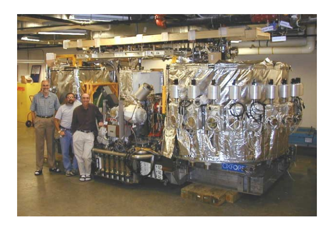
Fig. 1. The superconducting electron storage ring Helios-1 at Jefferson Lab. The synchrotron radiation ports are sealed by valves and can be seen on the right of the photo. L - R. Andrew Hutton, Ron Lauzé and Gwyn Williams.

Jefferson Lab is planning a facility for studying ultrafast dynamical processes using a 1kW average power IR/UV FEL, and a mode-locked Ti-sapphire femtosecond laser in the visible, combined with a 1 nm critical wavelength electron storage ring. Light pulses from the three sources will be synchronized at 125 MHz for pumpprobe studies (including pump-pump-probe and pumpprobe-probe options) in chemistry, physics, materials science, medicine and biology. The FEL operates with pulses as short as 300 femtoseconds ( \sigma ), which will provide the narrow bandwidth pump at high peak as well as average power. The FEL is currently operating and will soon be upgraded to operate at up to 10 kilowatt average power at an extended wavelength range from 300 nm to 10,000 nm. A compact superconducting storage ring, Helios-1, has recently been donated to Jefferson Lab that has a critical wavelength of 10Å and is capable of storing currents up to 800 mA. In addition to providing spectroscopy capabilities, the storage ring will also support exploratory x-ray lithography R&D, including a precision stepper-aligner for training purposes. The facility, which is expected to become available in 2004, will be described and the capabilities detailed.