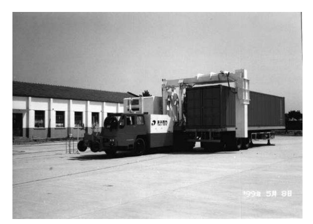
Figure 4: View of the mobile container inspection system.

While most ports have insufficient space to install the above mentioned "fixed type" inspection system. They also have less containers to inspect. In this case, a kind of mobile, flexible, self-shielding, compact system is necessary. In order to meet these requirements, a new system has been developed, which is mounted in a truck. In the truck, a radiation head, including accelerating tube, modulator, magnetron, cooling system etc, is situated in one corner. The control room can be put above the truck, or set up inside a separate truck. Sometimes a diesel generating set is required as a power source. A \Gamma type detector array is mounted at a movable "arm", which can be put back on the truck when the truck is moved. System mounted in a truck should be very compact and low power consumption. Fig.4 provides a picture of the mobile container inspection system.