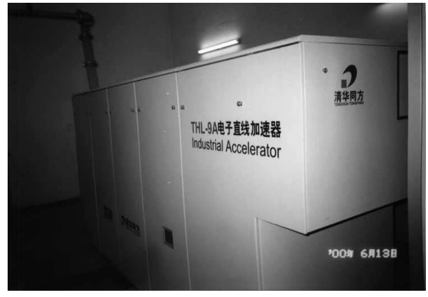
Figure 2: View of the radiation head of the linac.

The radiation head of the linac is shown as Fig.2. The microwave power source is situated in other room.