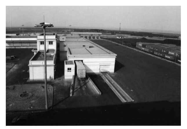
Figure 3: View of the building and working field of the system at Tianjin seaport customs.

Seven sets of these systems have been installed at the seaport customs areas in Tianjin, Dalian, Qingdao, Shanghai etc. Fig.3 shows the building and working field of the system at Tianjin seaport customs.