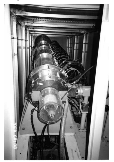
Figure 1: View of structure of the 9MeV TW linac from the electron gun side.

can be centralized to a size of \phi 1.5mm. The dose rate is more than 4000cGy/min.m with duty rate 250pps. Fig.1 shows the view of structure of the 9MeV TW linac from the electron gun side.