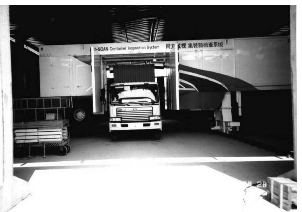
Figure 6: View of the double-housing gantry structure.

A double-housing gantry structure is employed in this system (Fig.6), with the radiation head mounted on one side of the gantry. The detector array is put in the other side and on top of the gantry, forming a \Gamma type structure. The modulator and the cooling system are placed on the opposite side to the radiation head. The primary tungsten collimator and front collimator are placed at the exit of the radiation head, with the back collimator being set at the entry of the detector array.