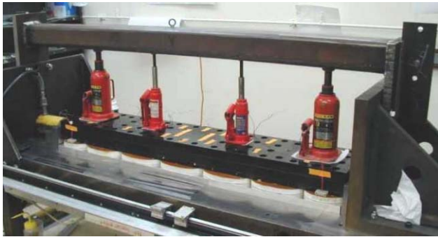
Figure 2: Magnet preload (yellow cylinder on the left)

2a) Placement and preloading of poles: The finished poles are placed on a 70 mm thick “yoke plate” that serves as flux return and support. Since the windings of adjacent poles experience large magnetic forces under operation, the coil assembly must be preloaded with about 16 tons of force (~40 MPa pressure on coils) to prevent coil motion after cooldown and the accompanying shrinkage of material. Because of small variations in final coil package dimensions, the gaps between coils must be filled with custom fitted shims to assure uniform pressure.