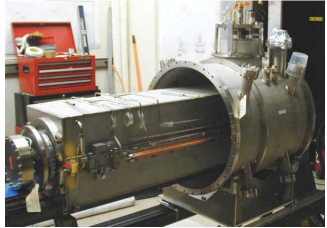
Figure 3: Cold mass in first cryostat section with stack

3) Assembly in cryostat: Once assembled, the whole cold mass assembly is placed on rails ready for the cryostat and 77 K heat shield. A short section of the outer cryostat shell is first put in place to give access for installation of wiring and tubing. Once the stack (current lead and instrumentation feedthrough) and cryogen tubing connections are made up, the second shell section is installed and suspension adjusted to properly position the cold mass. Vacuum leak checks are performed before and after final welding of the end plates.