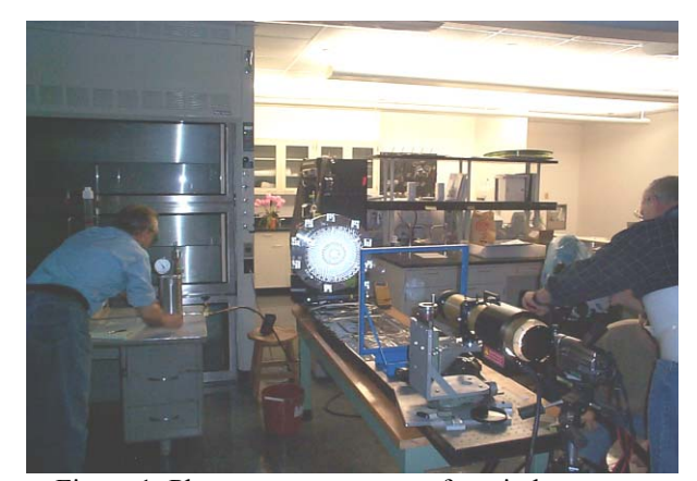
Figure 1: Photogrammetry setup for window tests..

An effective ionization cooling channel will require low-Z absorbers with sufficient cooling capacity to handle heat loads on the order of hundreds of watts. These absorbers need to be placed in low beta regions, requiring high magnetic fields or large field gradients, with sufficient accelerating gradient to achieve cooling in the shortest practical distance. The MuCool Collaboration is engaged in R&D on all three technology fronts.