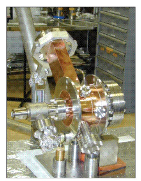
Figure 2. ORION rf gun after the final braze at SLAC.

The S-band rf gun for ORION is the standard 1.6 cell design used at BNL, ANL and UCLA. The gun was fabricated by J. Rosenzweig's group at UCLA and brazed at SLAC (Figure 2). Power conditioning of the gun is in progress at SLAC. Prior to actual use on ORION, an Mg cathode will be installed in place of the temporary Cu cathode plate. With its higher quantum efficiency (photoelectrons per laser photon), Mg will permit the use of a less expensive, low-power laser for E163, the first experiment planned for the ORION facility, while also providing 1 nC bunches for NLC cavity phase shift measurements. The use of Mg cathodes on these guns is well established, including several years of operation at the BNL Accelerator Test Facility.