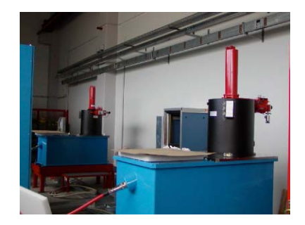
Figure 2: SPARC klystrons with oil tanks installed in the SPARC building (upper facility room or klystron hall).

The modulator power test, scheduled at the end of this month, will be performed initially with the klystron operating in diode-mode. The installation of waveguide distribution network and RF devices (circulators, shifters, etc.) will begin next month.