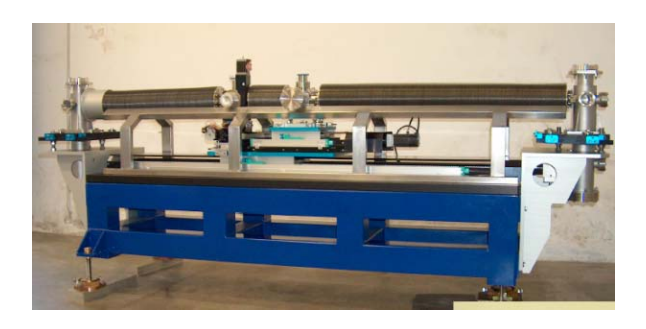
Figure 5: Emittance-meter device with long bellows.

order to conduct measurements of the rms normalized transverse emittance as a function of the drift length. This measurements will be performed at the beginning of next year running the beam at the RF-gun exit energy of 5.7 MeV, before installation of the 3 accelerating sections.