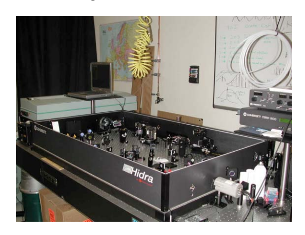
Figure 3: HIDRA-50 amplifier for the SPARC laser.

conducted next month at LNF. The HIDRA-50 amplifier system, made of one regenerative and two multi-pass amplifiers, has already reached the specs in the infra-red, delivering 50 mJ of output pulse energy with 104 fs pulses and good beam quality ( M_{\rm x}^2\!=\!1.9 and M_{\rm y}^2=\!1.6 ). Preliminary tests in the UV (266 nm), performed after the third harmonic crystal and the UV stretcher, showed the capability to reach 1.8 mJ of pulse energy with quite good pulse-to-pulse stability, i.e. less than 4.5%, and a fairly good beam quality, i.e. M_{\rm x}^2\!=\!2.7 and M_{\rm y}^2=\!1.9 . These tests will be further completed at LNF soon.