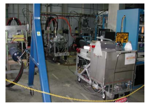
Figure 2: Bake and RF test stands for FPCs processing.

The 1 MW 805 MHz pulsed RF power stand at JLAB [6] was used to perform RF conditioning and power tests on all medium beta couplers and a several pairs of high beta couplers. From April 2004, the bake and RF test stands had to be moved, re-commissioned and used at SNS – Oak Ridge (Figure 2) [7].