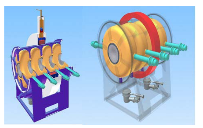
Figure 1: A three-dimensional view of the RFCC module for MICE

To prevent the thin beryllium windows from experiencing differential pressure, the space outside the cavities must be evacuated. The cavity vacuum and the external vacuum are interconnected. The external vacuum is separated from the coupling magnet cryostat vacuum in order to prevent contamination of the RF vacuum by volatiles from the magnet multi-layer insulation.