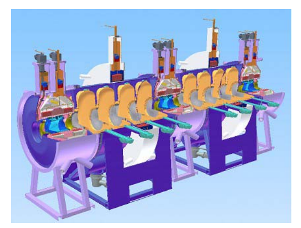
Figure 2: A cross section of the MICE cooling channel that includes three AFC modules and two RFCC modules.