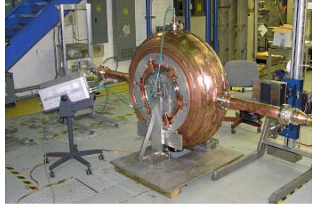
Figure 4: The 201.25 MHz prototype cavity with water cooling tubes (copper) welded onto the outer surface of the cavity. Two RF loop couplers were attached to the cavity for low power RF measurement of the frequency and coupling.

Progress on the coupling coil magnet design for the MICE cooling channel is reported in [7] at this conference and will not be repeated here.