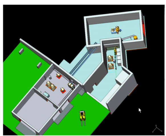
Fig. 1, The MUCOOL Test Area. The experimental area (top) is connected to hydrogen refrigeration equipment (lower left). Beam will enter from top right.

The site of the MTA was chosen to permit reasonable lengths of coax and waveguide to power experimental 805 and 201 MHz systems using the spare klystrons in the Fermilab linac gallery. The facility can also be used for hydrogen target tests, high intensity beams to test