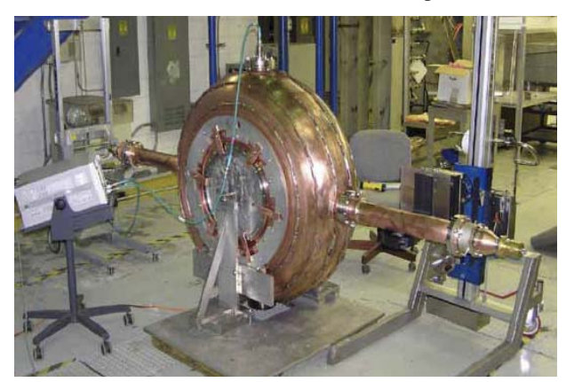
Fig. 3, The 201 MHz Cavity.

One of the main uncertainties of the MICE experiment is the magnitude of the x ray background produced by field emission of electrons in the cavity. In principle this background can be controlled by suppressing field emission with coatings in the cavity. There are a number of experimental problems that have been encountered with this approach however, since it is not clear which coatings would be most useful, what the best method of application is, what the bonding strength of the coating to the substrate is, and is what happens if the coating comes off. The 805 MHz cavity is a more efficient test assembly than the 201 MHz cavity, which is more expensive. An experimental program is being set up at Northwestern University Center for Atom Probe Tomography to use field ion microscopes to understand the basic material science behind breakdown and dark current phenomena.