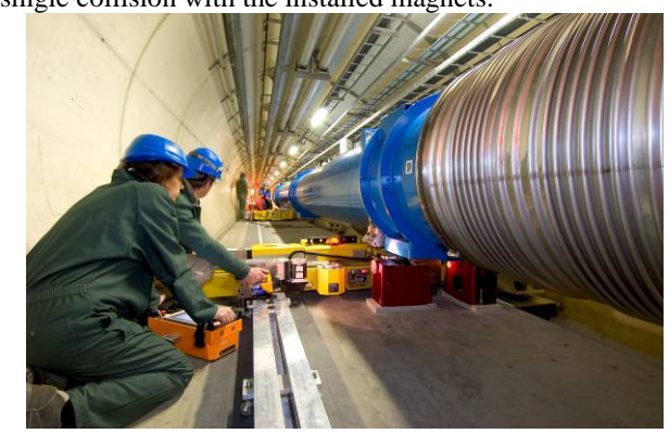
Figure 1: Transfer of a main dipole magnet on the support jacks.

The 1232 main dipoles, 424 Short Straight Section (SSS) and 90 Long Straight Section (LSS) magnets were lowered through the access shaft and then transported with the tunnel vehicles up to 17 km to the installation point. The dimensions of the tunnel vehicles produced by the consortium BNN/MAFI (Germany) needed to be highly optimised in order to transport cryo-magnets up to 16.5 m long and weighing up to 34 t through a transport volume that is very limited in both vertical and lateral directions. The hydraulic braking system and suspension were, together with the rubber tyres, required to respect the low acceleration limits for the fragile magnets. Finally, an optical guidance system and anti collision detectors were used to guide the vehicles driving up to 4 km/h next to already installed magnets and other equipment with often not more than 10 cm clearance. More than 21'000 km was driven this way without a single collision with the installed magnets.