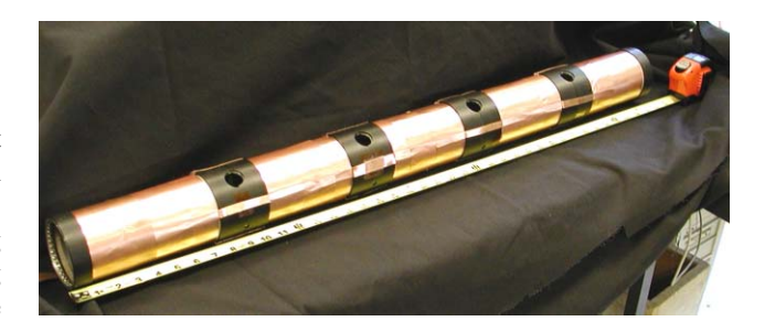
Figure 1: The one-meter-long BaTiO<sub>3</sub> FEPS consists of five individual sources with diagnostic ports between the sources.

Simply connecting the five sources in parallel to a single pulse-forming network power supply yielded non-uniform source performance due to the time-dependent nature of the load that each of the five plasma sources experienced. Furthermore, the first two sources fabricated were extensively tested compared to the remaining three.